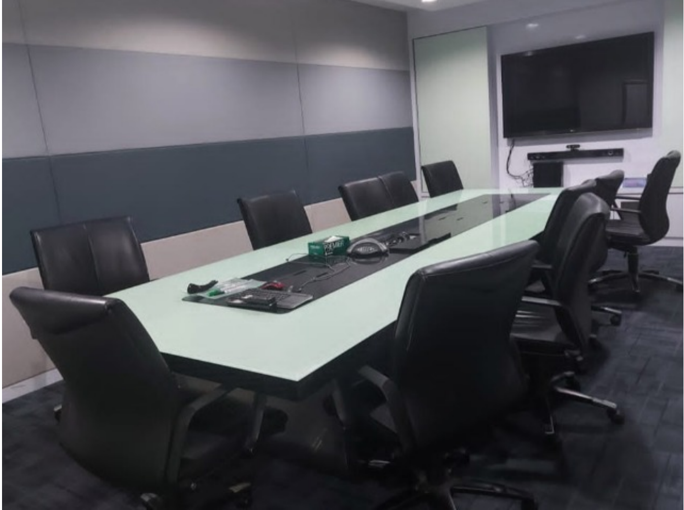
Page 5 of 6