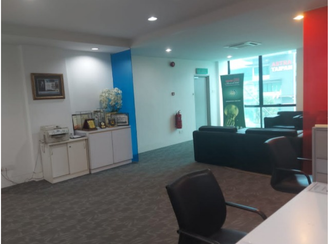
Page 4 of 6