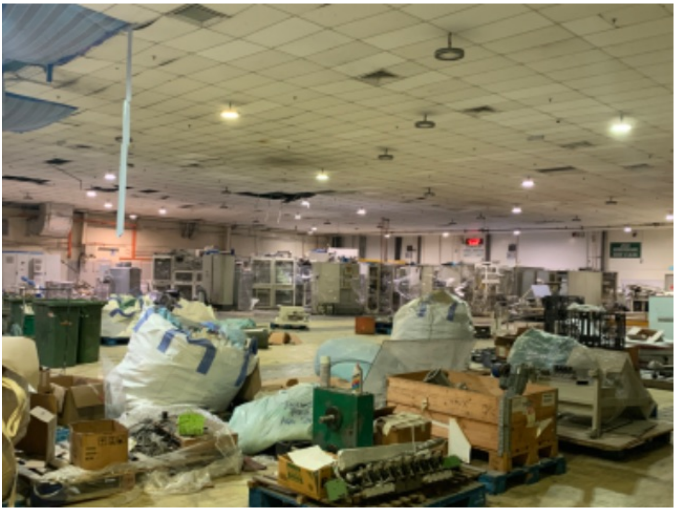
Page 6 of 7