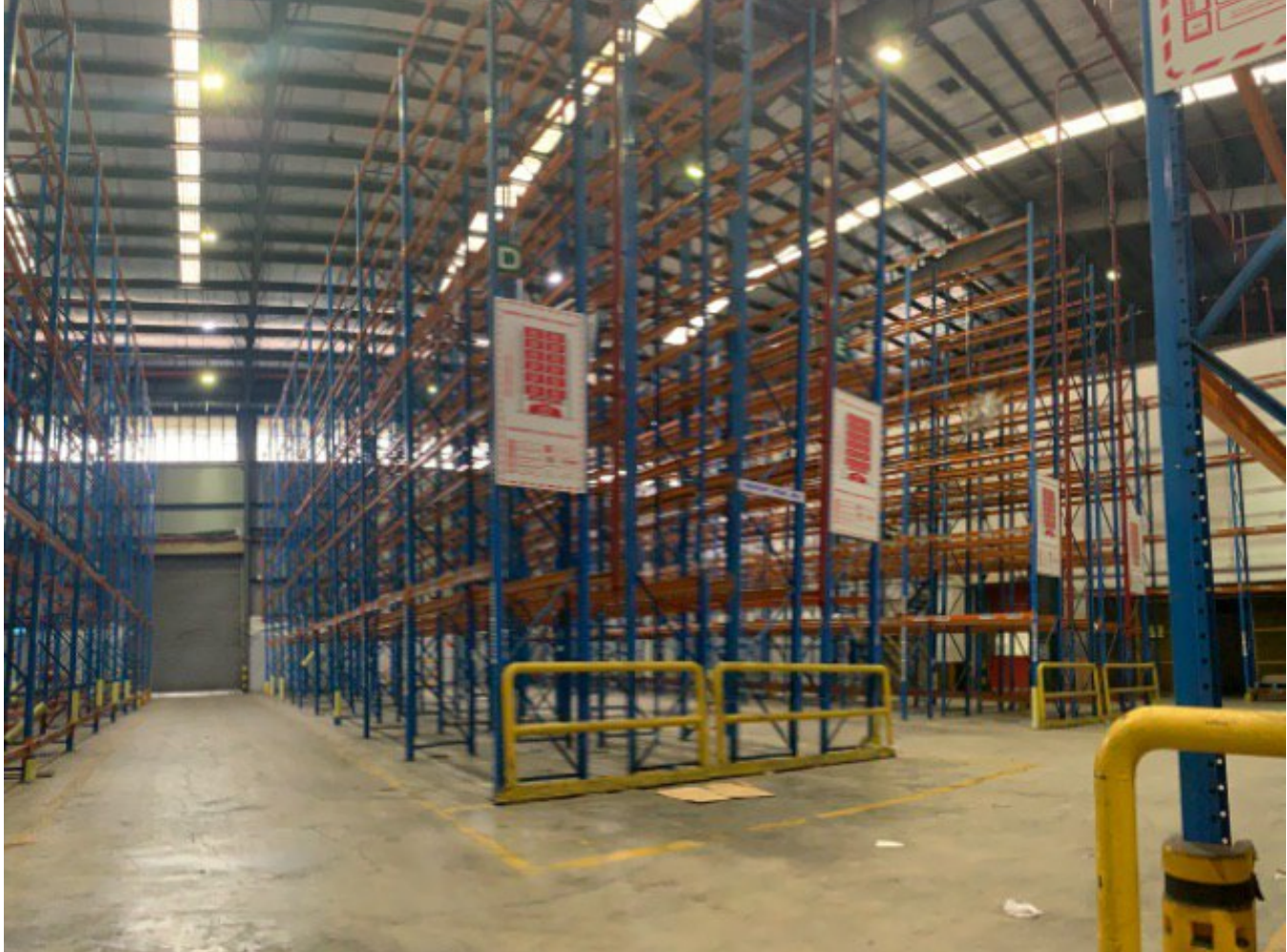
Page 5 of 7