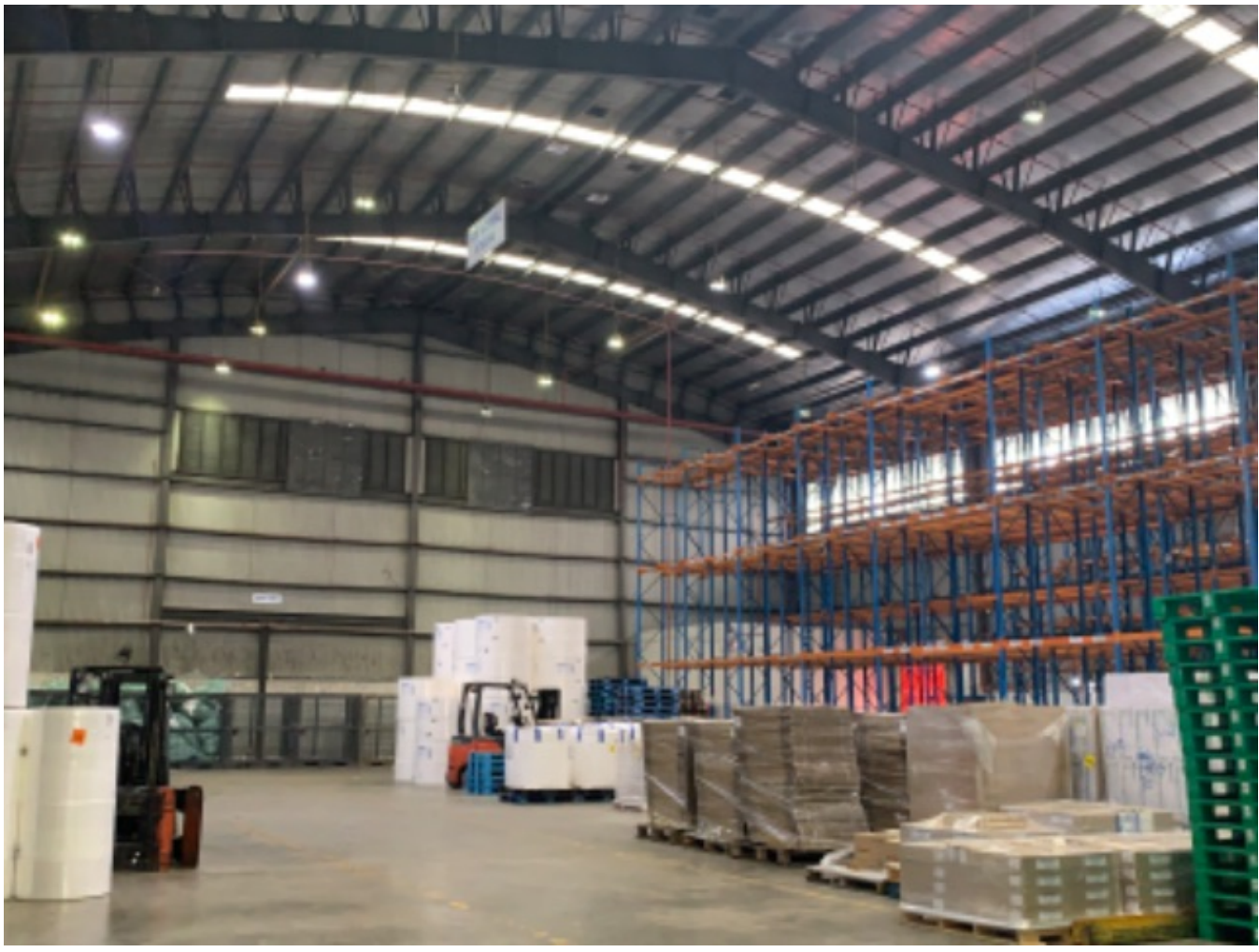
Page 4 of 7