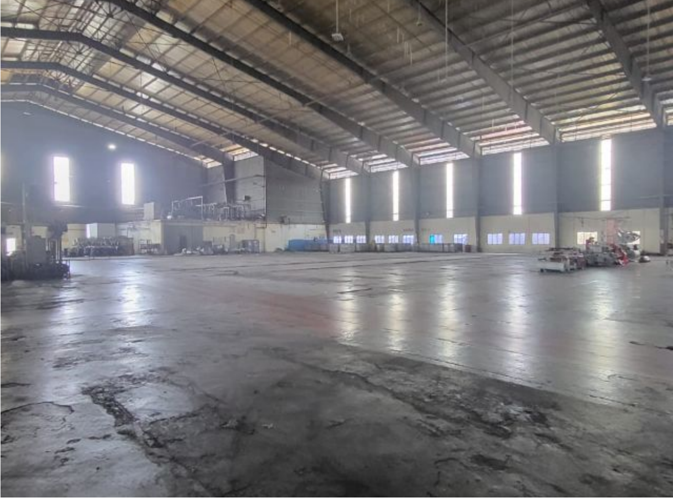
Page 4 of 4