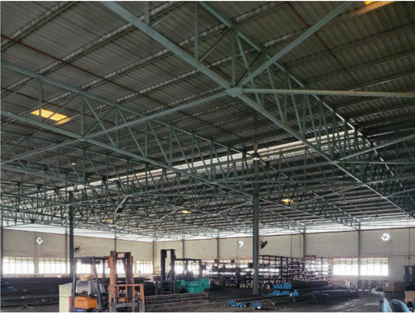
Page 4 of 5