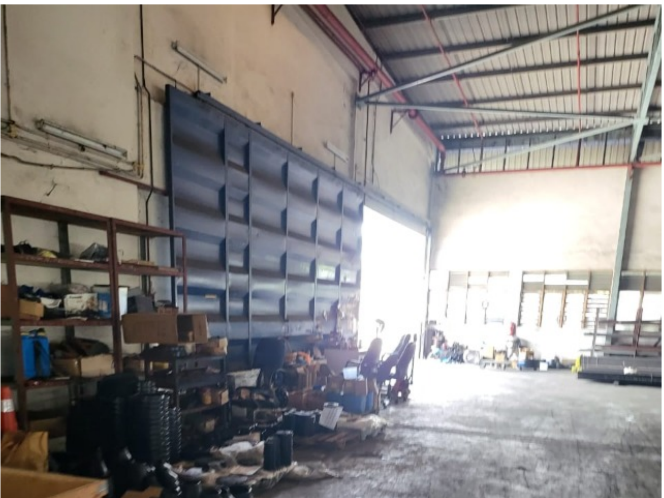
Page 3 of 5