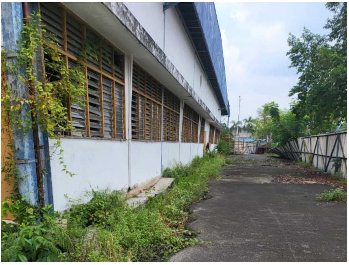
Page 5 of 5